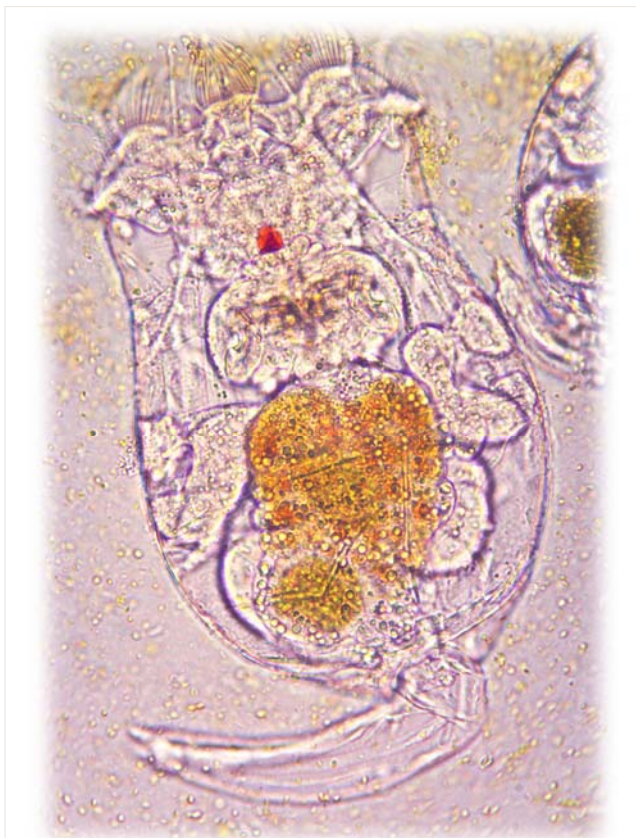
Rotifer feasting on RotiGrow OneStep

Active, clean, healthy rotifers are essential for healthy larvae. Unfortunately, the extreme lipid content of conventional enrichment feeds is stressful to rotifers, weakening them and reducing their motility. Lipid emulsions foul the enrichment tank as well as the