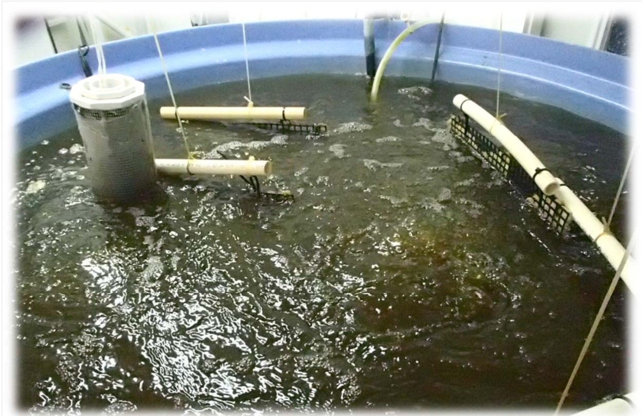
Clean continuous rotifer production on RotiGrow OneStep . 1 billion rotifers per day - 35% daily harvest at 3000 rotifers/ml. 22 hours since the last cleaning and the tanks are still clean.